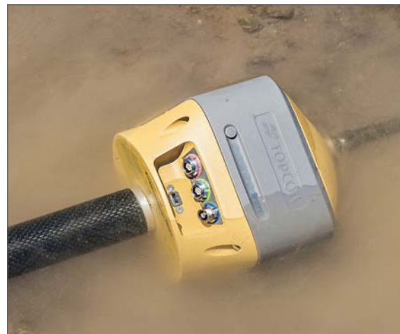
IP67 Waterproof Rating

Awkward shots on steep slopes or hard to reach spots are now a breeze with TILT™.